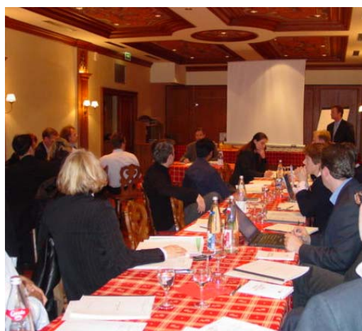
Overview of ANADO's General Assembly 2003.